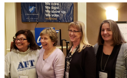
Randi Weingarten Stands in Solidarity with WSWHE and Questar III BOCES Leadership!

Randi Weingarten, President of the AFT, hosted the Northeastern Regional Meeting of the AFT at the Saratoga Hilton Jan. 25-26th, 2020. During this meeting discussions centered upon the importance of public education. We, as teachers, need to be cognizant of the