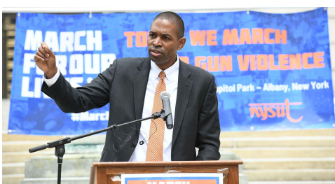
ALBANY, N.Y. June 16, 2022 — New York State United Teachers today endorsed Lt. Gov. Antonio

Delgado for election. The statewide union previously endorsed Delgado's running mate, Gov. Kathy Hochul.