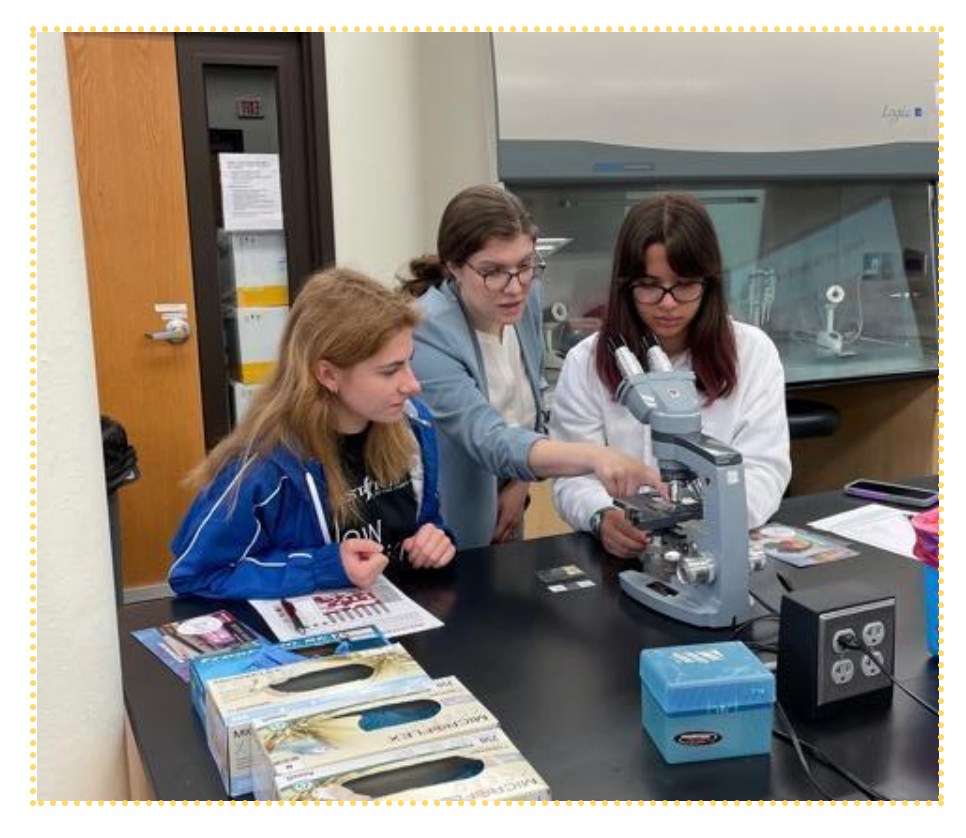
New Visions Scientific Research and World Health students learned microbiology concepts at the Albany College of Pharmacy and Health Science.